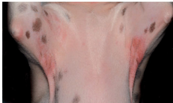
Figure 1. Localized acute flare of canine atopic dermatitis. This dog exhibits patches of erythema and oedema with excoriations on both axillae (example of case scenario 1a).

Case scenario 1b (moderate to severe acute flares). The dog is affected with multifocal patches of oedema, erythema, papules and excoriations on the axillae, groin and medial thighs (Figure 2). He scratches nearly nonstop all over the body.