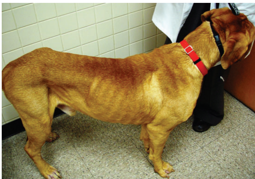
FIG 3. A dog with severe heart failure and cardiac cachexia. Careful attention to monitoring bodyweight and muscle condition allows the clinician to detect cachexia at an earlier and more subtle stage, when interventions such as omega-3 fatty acids are more likely to be beneficial

Cardiac cachexia is a loss of lean body mass that occurs in heart failure (Fig 3; (Freeman and Roubenoff 1994, Freeman and others 1998, von Haehling and others 2009)). Cachexia has important detrimental effects in the cardiac patient and is an independent risk factor for mortality in people with heart failure (Anker and others 1997b, Anker and others 2003).